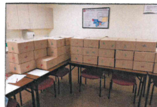
Getting the kits ready for distribution to the districts.