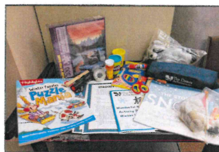
Contents of the 3-5 boxes.