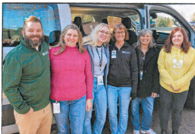
The Dawes Arboretum Crew designed and packed the kits, and even loaded them in the van!

Because homeless families and students tend to move frequently, there are often gaps in academics. To help bridge those gaps the OVESC purchased 200 science kits prepared by the wonderful staff at Dawes Arboretum for McKinney-Vento eligible students in grades K-12 to have over Christmas break. Each kit has 5 science activities with all of the materials needed along with some extra goodies.