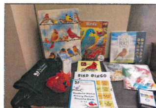
Contents of the K-2 boxes.