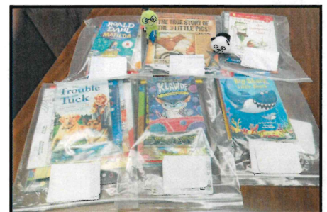
Some of the books chosen by Belpre students.